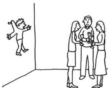
DON'T STICK ANYTHING ON THE WALLS