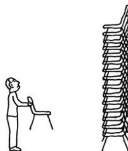
STACK THE CHAIRS AS YOU FOUND THEM