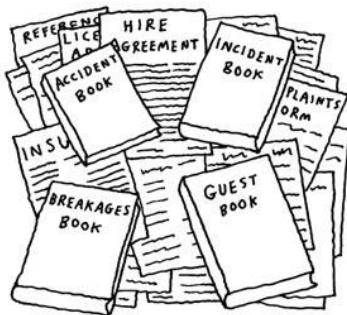
FILL IN THE PAPERWORK