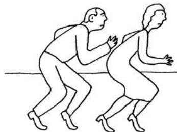
ARRIVE AND LEAVE QUIETLY