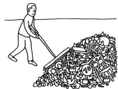
CLEAN EVERYTHING UP